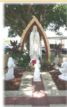
Our Lady of Fatima, pray for us.